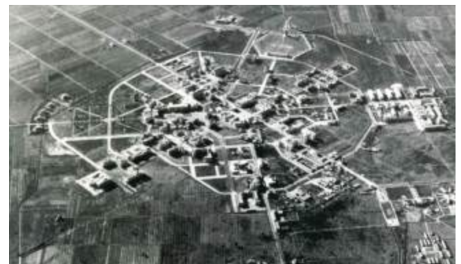
Littoria, aerial view July 1939, Pontine Marshes, Italy • Edit. S. Zevi, Restituamo la Storia, dal Lazio all'Oltremare: modelli insediativi della piana pontina, Gangemi, 200