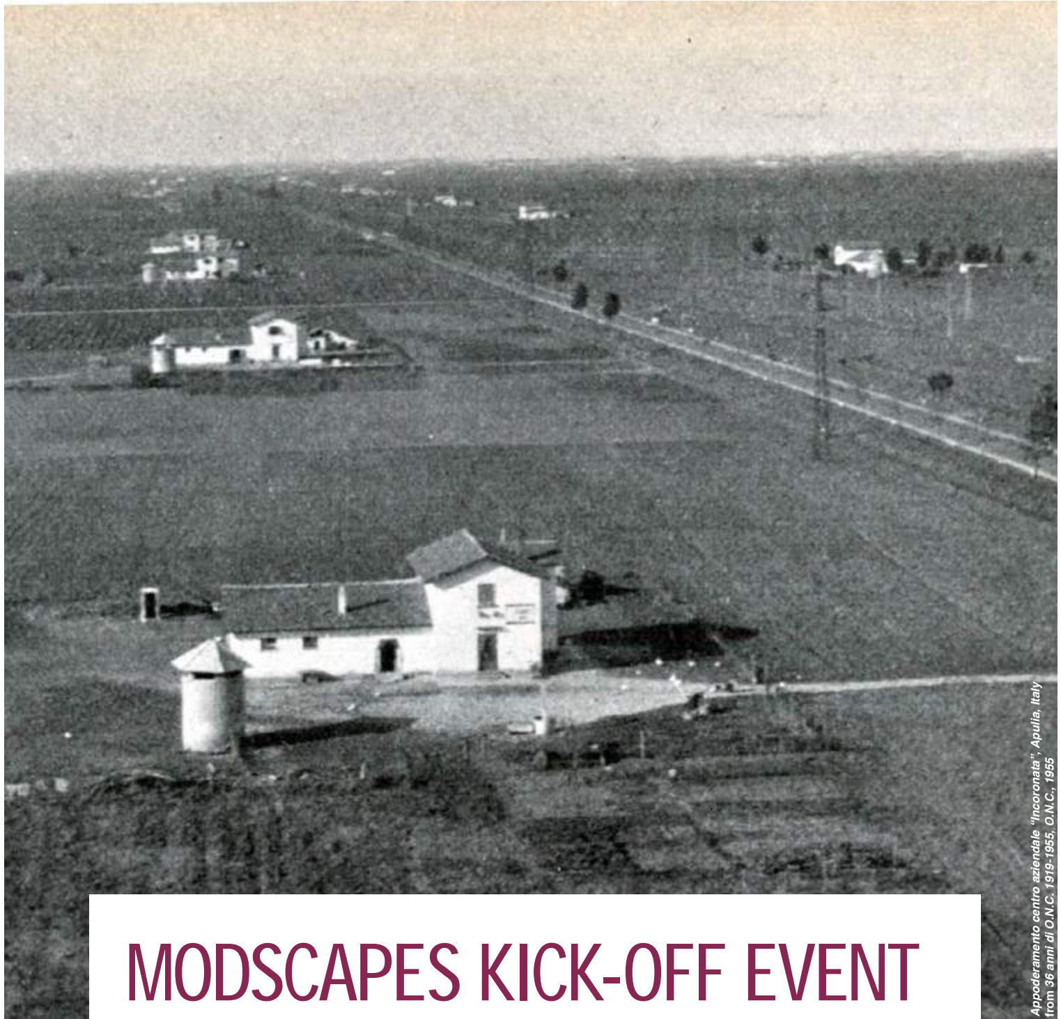
Appoderamento centro aziendale "Incoronata", Puglia, Italy from 36 anni di O.N.C. 1919-1955, O.N.C., 1955